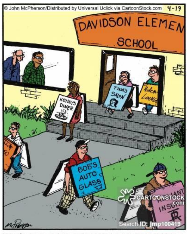
"At $50 a sandwich board per week, multiplied by 800 students, it'll really help balance the school budget this year."